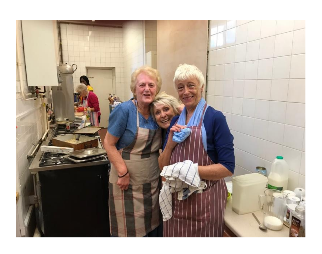
FROM THE OLD INTO THE NEW ..... KEEP ME TRAVELLING ALONG WITH YOU